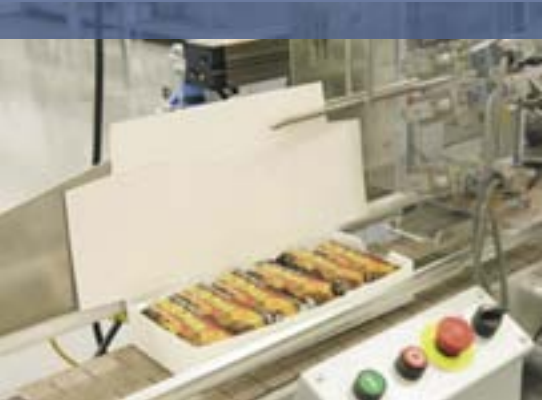
Carton in 840e closer