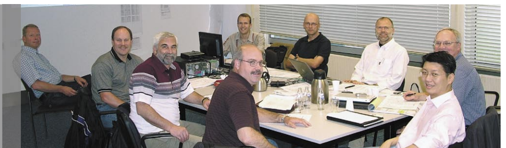
Project team at a recent review meeting at Tevopharm.

The new flow wrapper has a simple but smart design incorporating minimal parts to increase reliability, streamline maintenance, and allow for greater adaptability. To enhance sanitation, the infeed, fin wheels and cutting head on the new machine are cantilevered and a