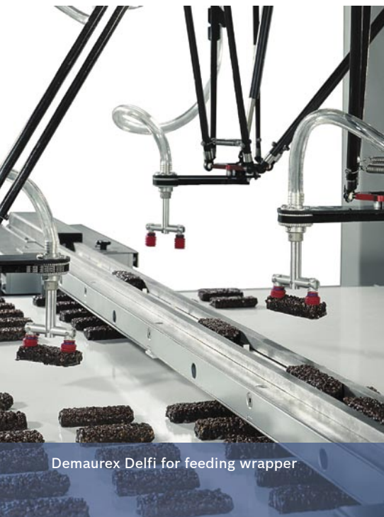
Demarex Delfi for feeding wrapper

conveyor for a different configuration. In this case, the cookies travel on Transver belts conveyors, pass through Demarex Delfi and the Tevopharm wrapper, return on Transver belts and finally feed into a Demarex Presto Dual Collator. Not only products pass from one machine to the next, data is also exchanged. The Delfi systems provide the Pack-200 with its input rate so the wrapper to adjust its own speed, increasing the line’s efficiency.